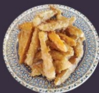
炸香蕉/炸番薯 DEEP FRIED BANANA SWEET POTATO SESAME SEEDS