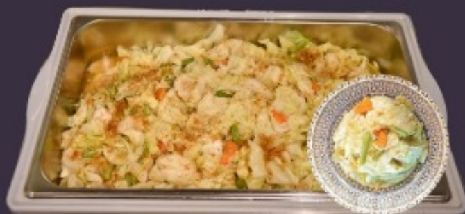
蒜蓉蚝油时蔬 WOK-FRIED CHINESE CABBAGE WITH OYSTER SAUCE & GARLIC