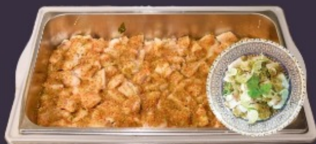
柠檬蒸鱼 STEAMED FISH WITH LEMON & CHILIES