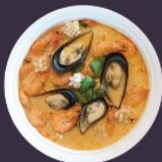
冬阴海鲜汤 TOM YUM SEAFOOD SOUP