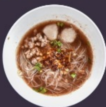
泰式猪肉丸黑汤粉 NOODLE WITH PORK BALL IN BLACK SOUP