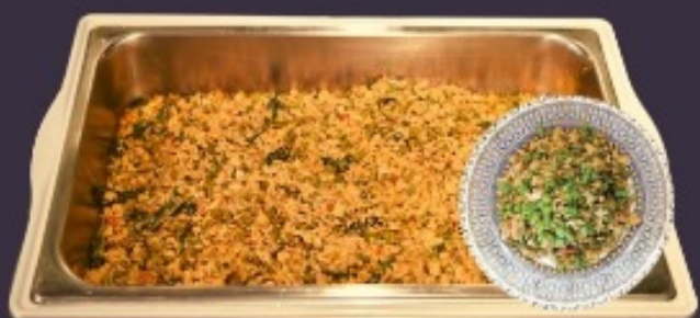
打抛鸡肉 STIR-FRIED CHICKEN & HOLY BASIL