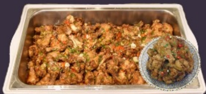
麻辣鸡腿 BRAISED CHICKEN DRUMSTICK MALA