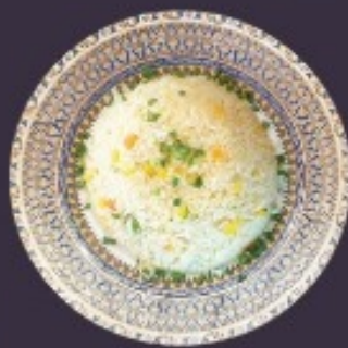
蛋炒饭 FRIED RICE WITH VEGETABLE & EGG