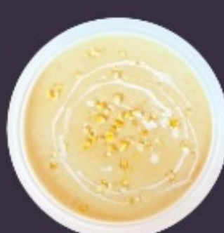
玉米浓汤 CORN SOUP