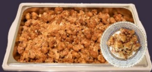
蒜香鸡腿 GARLIC FIRED CHICKEN DRUMSTICKS