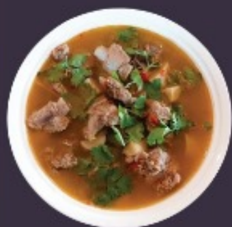
酸辣排骨汤 HOT & SPICY SOUP WITH PORK RIBS