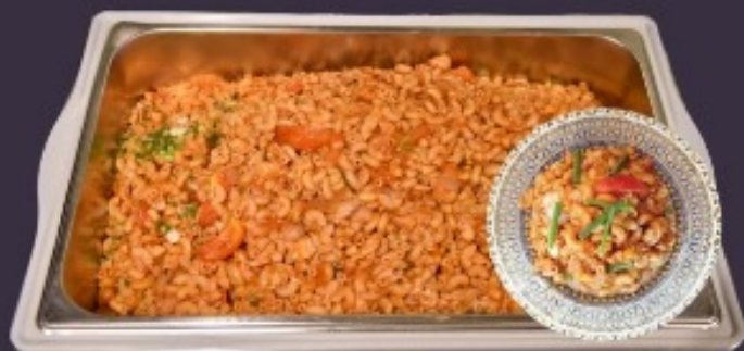
鸡肉通心粉 CHICKEN MARCARONI