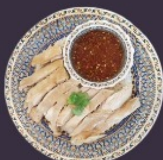
泰式鸡油饭 STEAMED RICE TOPPED WITH CHICKEN SAUCE