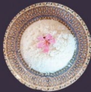
茉莉香米 STEAMED RICE