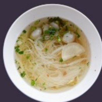
泰式猪肉丸清汤粉 NOODLE WITH PORK BALL IN CLEAR SOUP