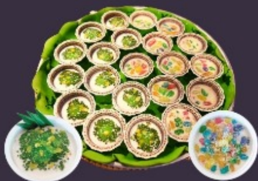
椰浆西米露/椰浆布丁 SAGO WITH CORN/GNOCCHI IN COCONUT MILK