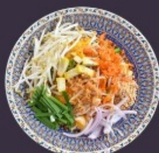
泰式炒粉 FRIED NOODLES THAI STYLE