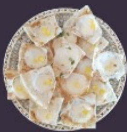
椰子饼 TRADITIONAL THAI COCONUT RICE PUDDING