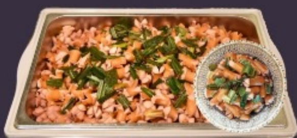
迷你香肠 MINI SAUSAGES