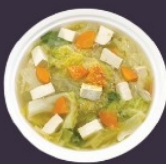
时蔬汤 - 素 VEGETARIAN SOUP