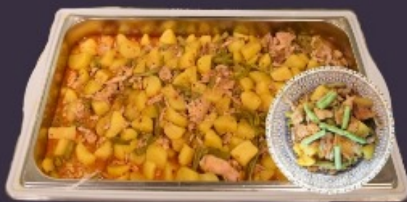
麻辣炒猪肉 STIR-FRIED PORK WITH GARDEN PEA, CHILIE & MALA SAUCE