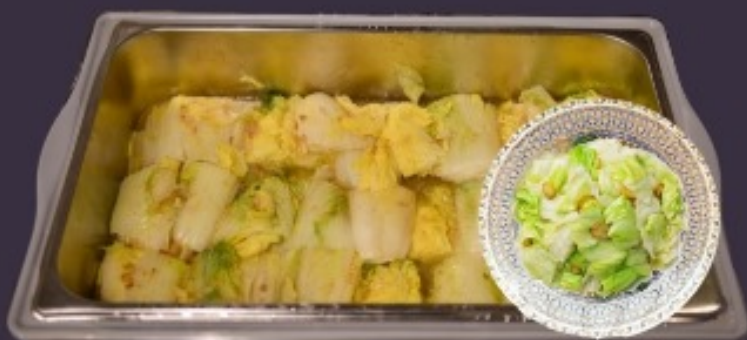
蒜蓉时蔬 GARLIC SEASONAL VEGETABLES