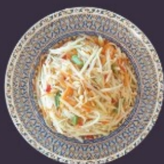
木瓜沙拉 PAPAYA SALAD THAI STYLE