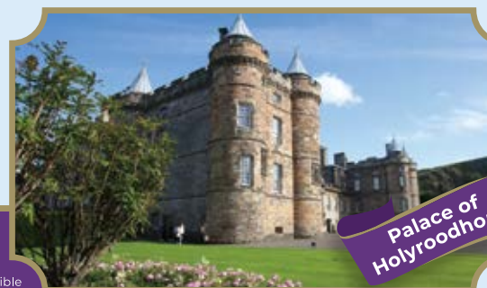
Palace of Holyroodhouse

The official residence of His Majesty The King in Scotland and home of Scottish Royal History. Visit the magnificent State Apartments still used by the Royal Family today and step inside the historic chambers of Mary, Queen of Scots. A complimentary multimedia guided tour is available in 10 languages. The English-language guides feature versions for families and D/deaf or hard of hearing visitors.